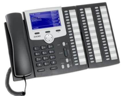
CTS-330 with CTS-338 console

Phone profile is created and stored in Slican PBX memory. Phone can be used immediately after switching it on, without complicated and time consuming configuration. Programmable BLF buttons allow you to create individual functions, services or create a list of handy contacts. For your comfort and to increase number of programmable keys, you may connect to each Slican CTS-330 system phone series up to 4 CTS-338 consoles. With consoles you may program up to 170 buttons.