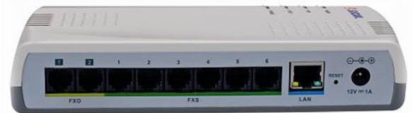
IP PBX Slican ITS